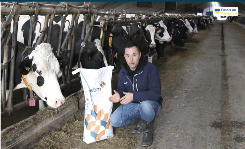
АБМ_VLOG #8 | Успіху важливий елемент – Інсорб сорбент!