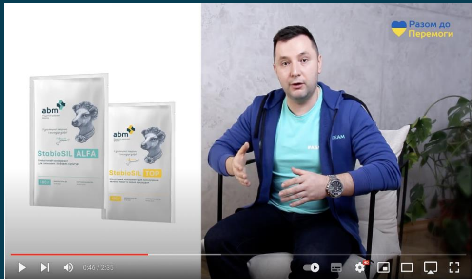
АБМ_VLOG #2 | Для якісного сінажу – StabioSIL Alfa®