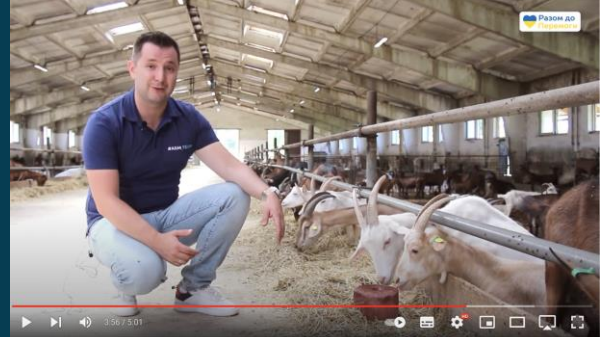
АБМ_VLOG #5 | Мінеральні блоки для тварин. В чому сіль?